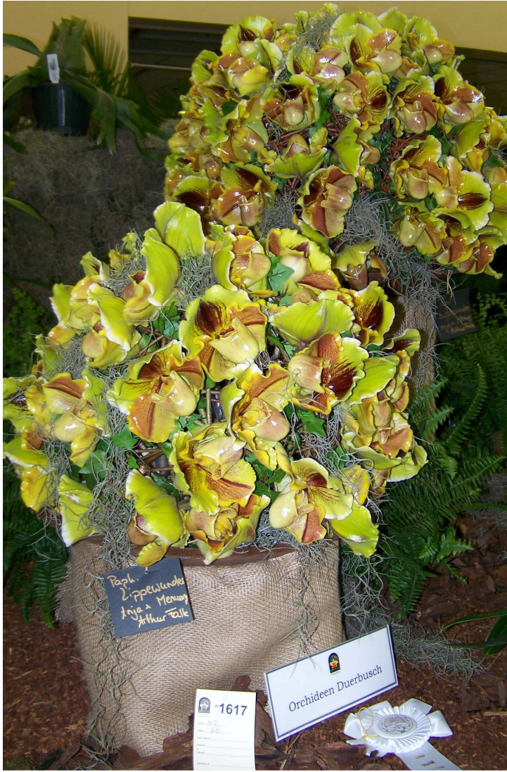
by: Alan Gettleman