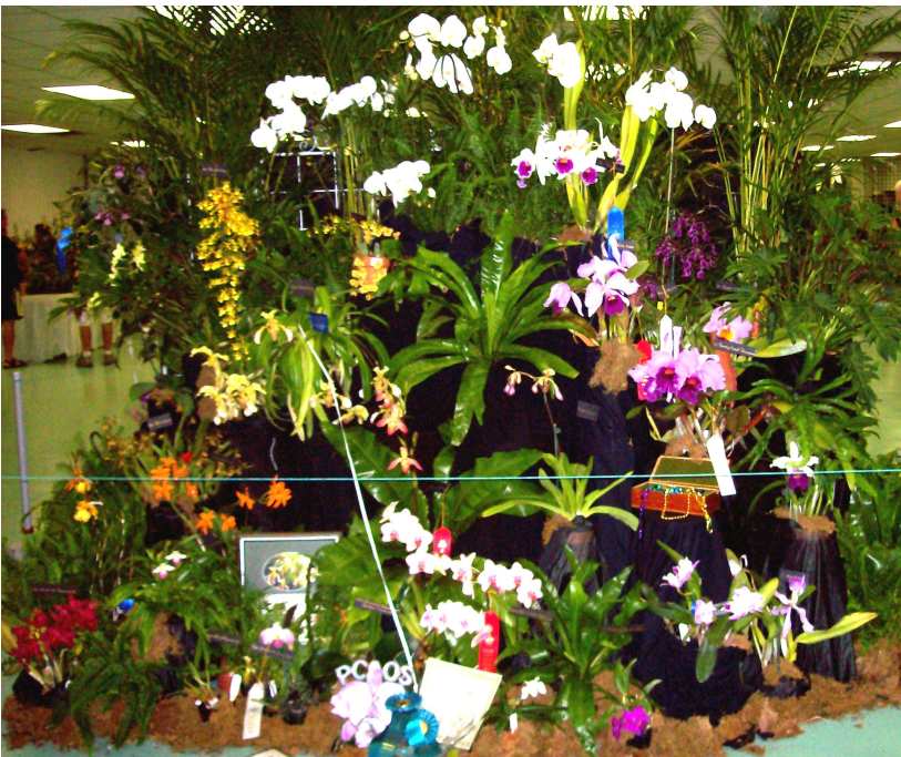
Platinum Coast Orchid Society's Display at Volusia County's show