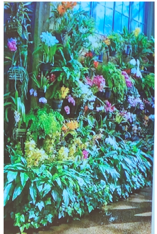
Notes for Exhibit 5