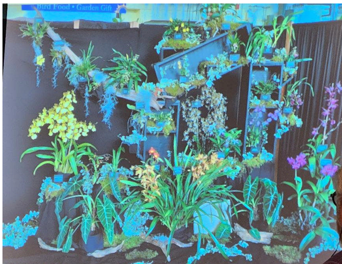
Notes for Exhibit 6