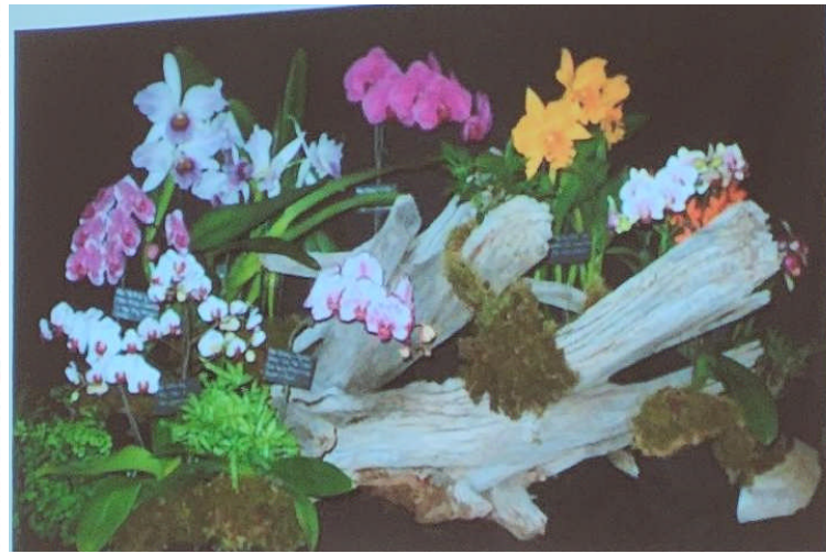
Notes for Exhibit 3: