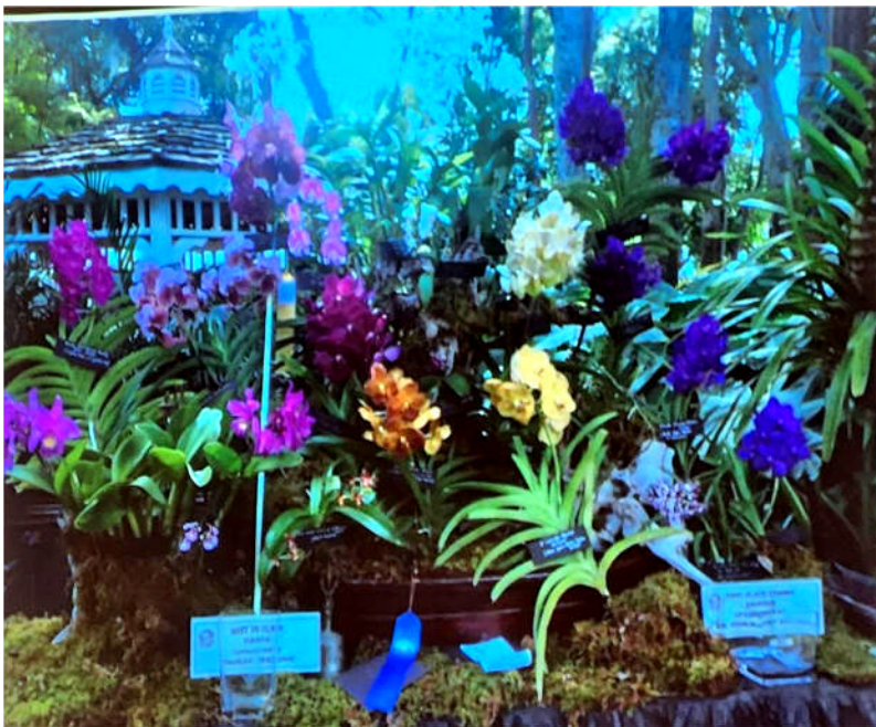
Notes for Exhibit 2: