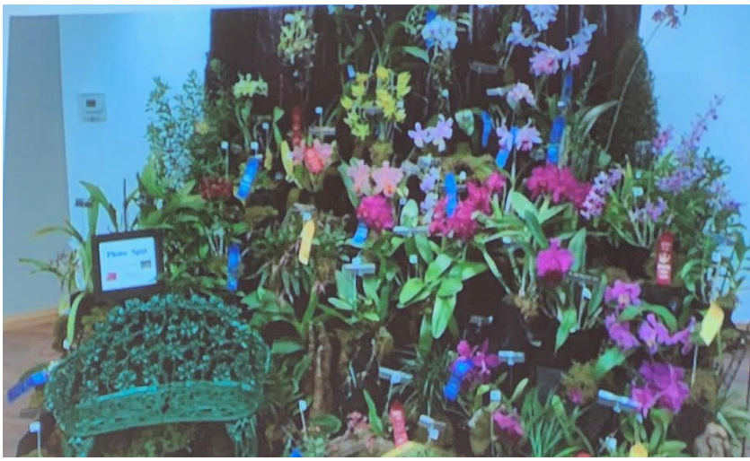
Notes for Exhibit 7