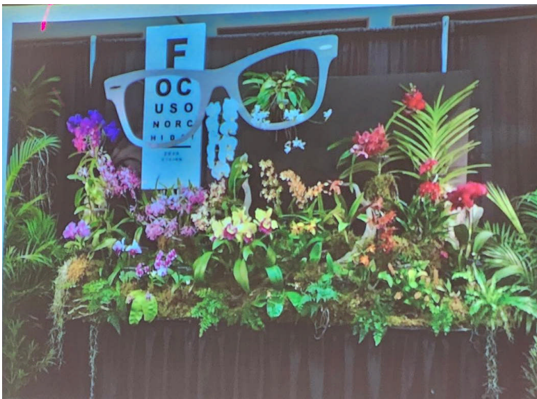
Notes for Exhibit 4