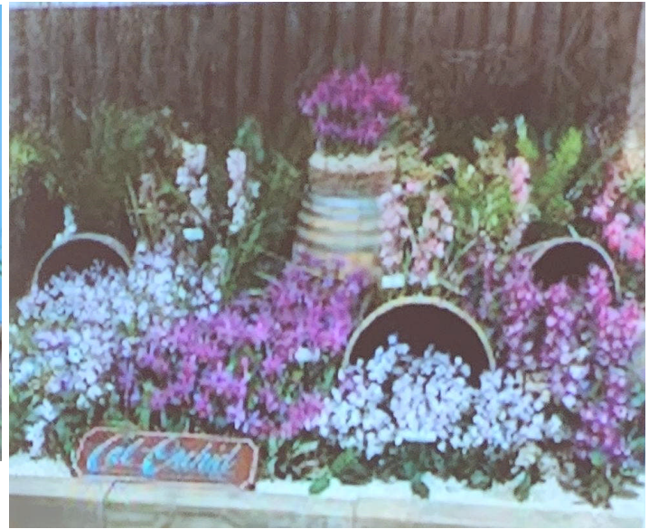
Notes for Exhibit 8