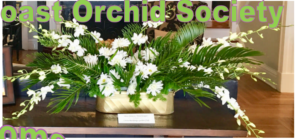
Dendrobiums used in floral arrangement.