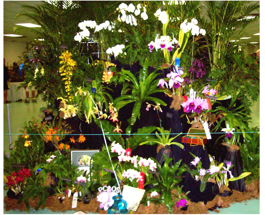
Platinum Coast Orchid Society's Display at Volusia County's show

Flowering May--Aug, occasionally as early as Feb. Epiphytic in cypress swamps, wet hammocks; 0--20 m; Fla.; West Indies.