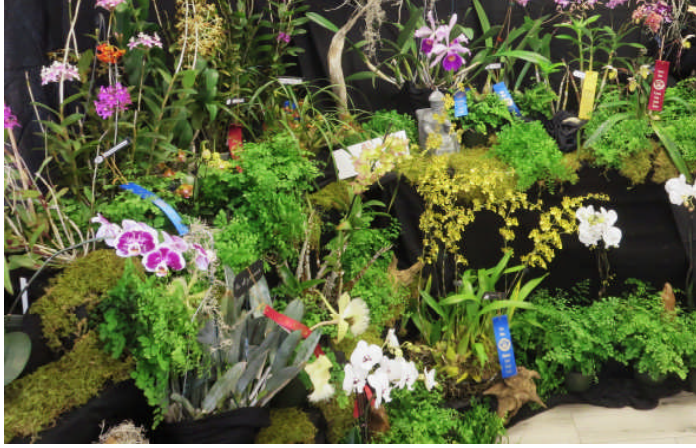
Completed society exhibit

Show dedication—Michelle MacDonald Fletcher brought in a collage of photos