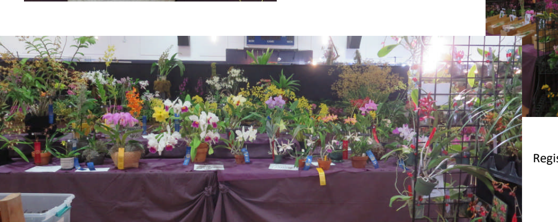
Registered plant table