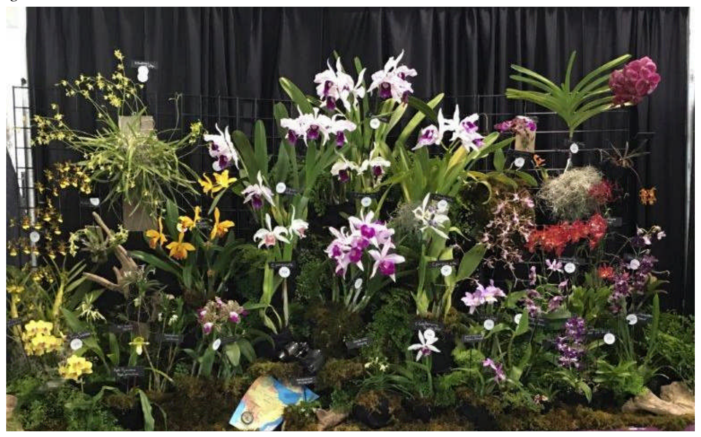
PCOS received a Second Place on the Exhibit. Nice color flow!!